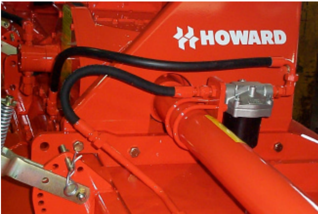
← HR501, viewed from front right hand side.