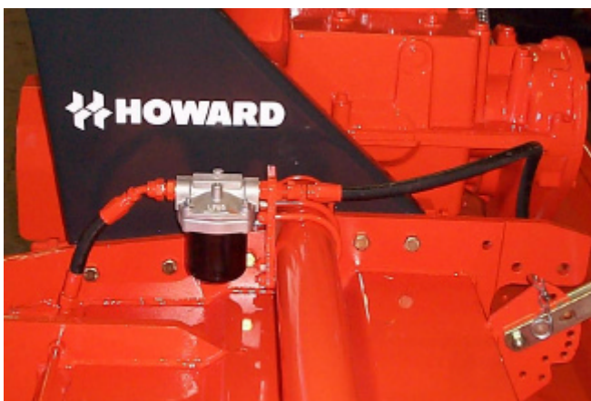
← HR61, viewed from front left hand side.

Note: Filter mounts to Jackshaft Hsg tube (89mm dia.)