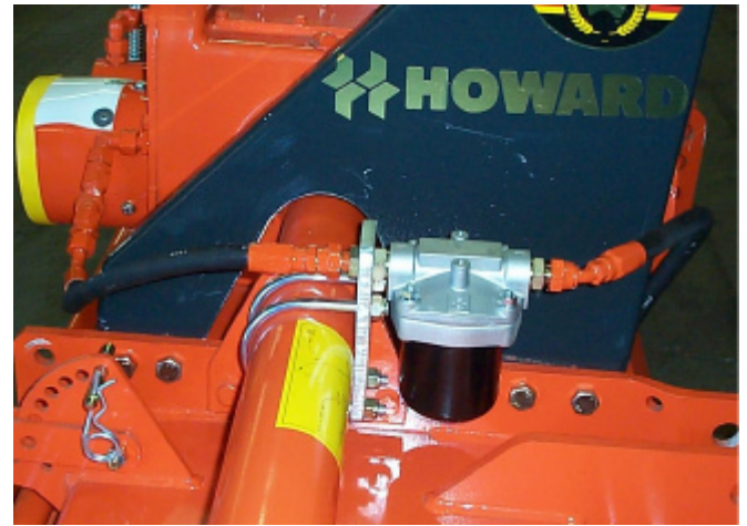
↑ HR43, viewed from front right hand side.