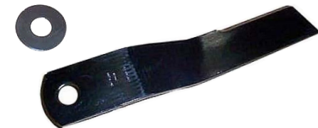
Hayline Blade (requires spacer)